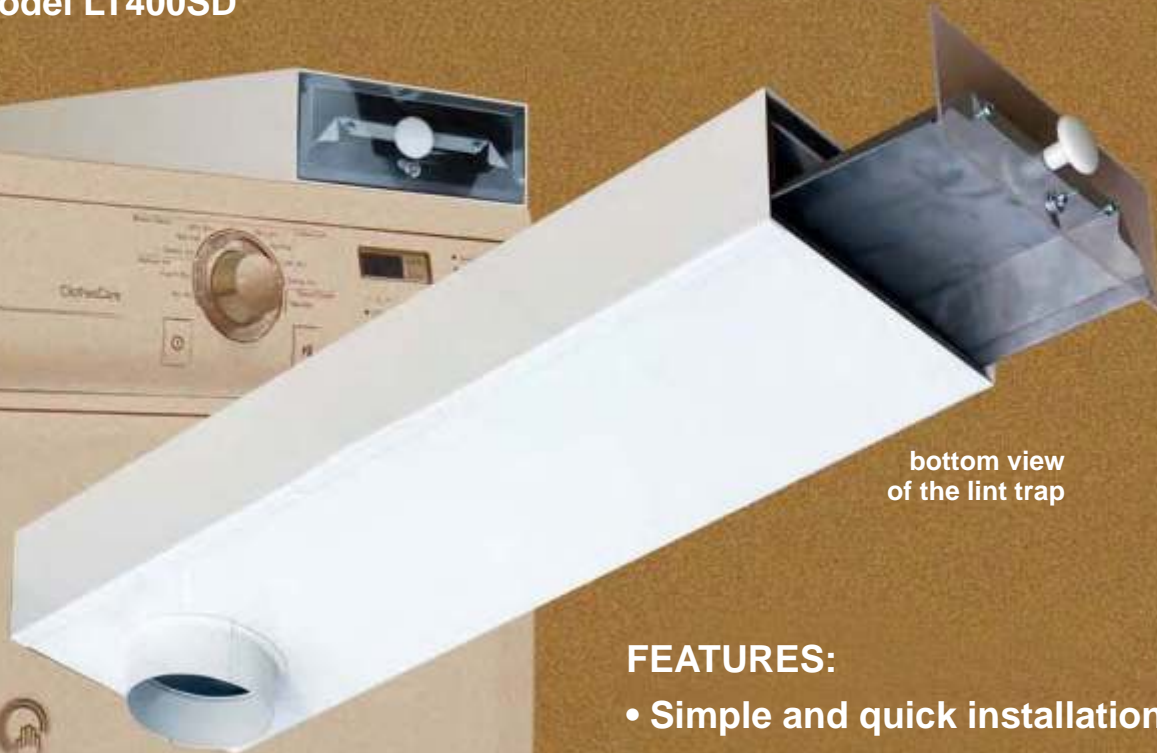
bottom view of the lint trap