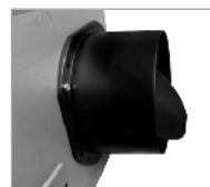
Plastic Backdraft Damper