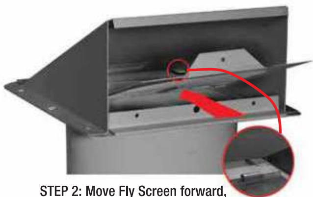
STEP 2: Move Fly Screen forward, placing back edge under lips, shown in circle