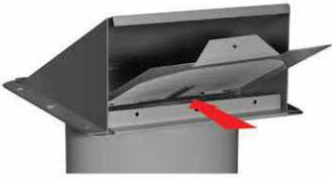
STEP 1: Insert Fly Screen as shown