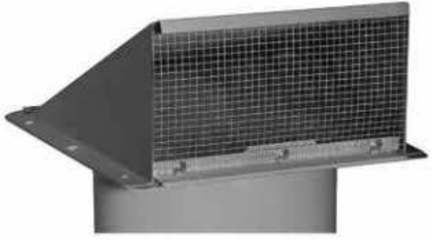
FINAL: FRESH AIR WALL CAP READY FOR USE