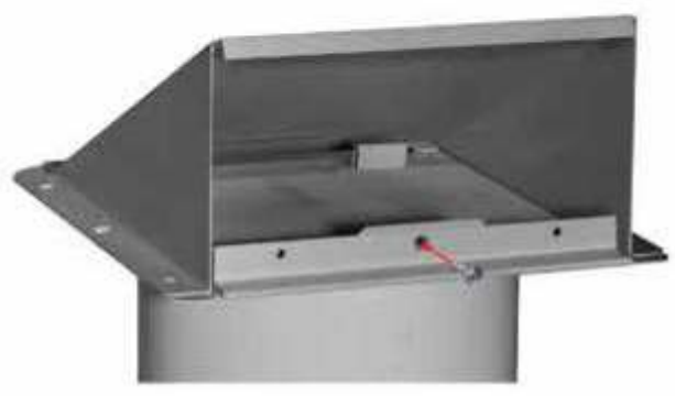
STEP 4: Line up screw holes & secure Fly Screen with screw