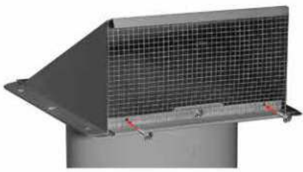
STEP 6: Secure Bird Screen with st. steel screws