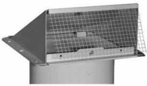
STEP 5: Insert Bird Screen as shown