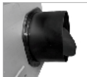
Plastic Backdraft Damper