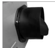
Plastic Backdraft Damper