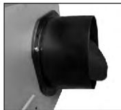
Hi-impact Polystyrene collar